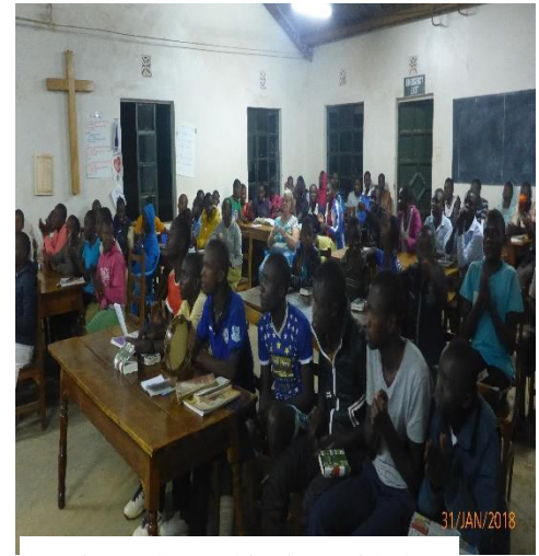
Praise and Worship time with the students.